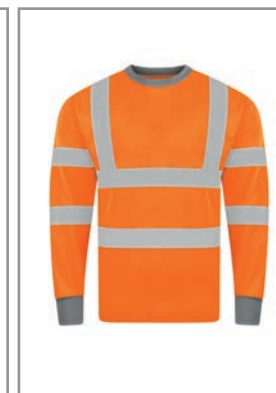
KXPCLSHIRTOR Hi-Vis Orange (Front) S - 7XL