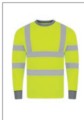
KXPCLSHIRTYW Hi-Vis Yellow (Front) S - 7XL

Industry, transport and logistics, construction, public authorities, airports