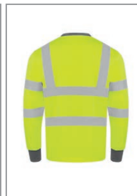
KXPCLSHIRTYW Hi-Vis Yellow (Back) S - 7XL