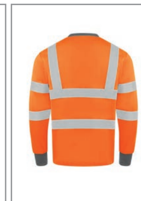
KXPCLSHIRTOR Hi-Vis Orange (Back) S - 7XL