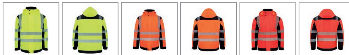
KKXBRSSHRJYWBK Yellow / Black S - 5XL (Front)

Industry, logistics, airports and harbours, construction sites Waterproof and windproof, the all-rounder with a unique design.